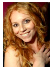
Better Days @ Pink