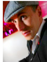
BASE Italy @ Pink