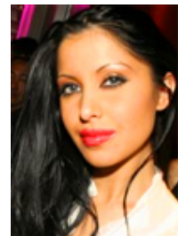
Derrick Carter @ Supperclub