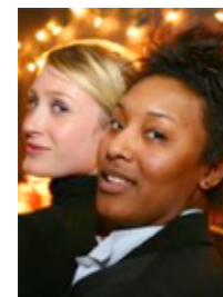
Qoöl @ 111 Minna